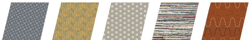
examples of (n)Deavor! custom designs

Morbern is one of North America's leading manufacturers and innovators of decorative vinyl upholstery fabrics. Established in 1956, Morbern has over 40 years experience supplying to the Marine Industry worldwide. Morbern Europe products are stocked in Amsterdam and sold through a wide distribution network.